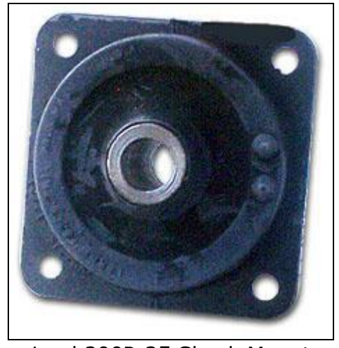
Lord 200P-35 Shock Mount

No hinge detail is shown in the photo below but the 2 bottom corners of the panel had alloy angles secured them and they in turn were secured to fuselage brackets which contained lord 2 inch square plate shock mounts.