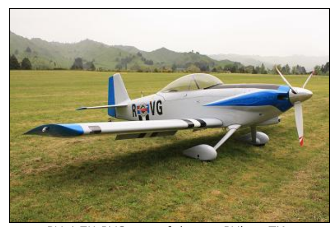
RV-4 ZK-RVG, one of the two RV's at TM.