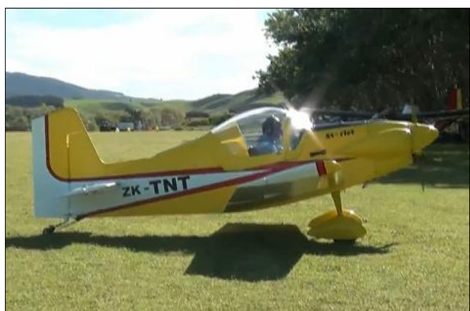
ZK-TNT at Raglan

While the weather put a dampener (pun intended) on much local flying a Poker Run, where entrants collected a playing card from each of several airfields and competed for the best 'hand' at the end, proved popular and will likely be repeated. It involves navigation to find the smaller strips, but winning is largely chance, depending on the cards you have collected, which are in sealed envelopes.