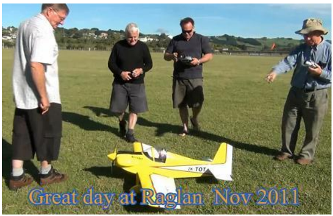
Big boys and their TOYs.

Access to mixture adjustments is apparently tricky and can only be done on the ground with motors stopped. Then repeat test flights to see if the results are better, worse, or about the same. A very frustrating exercise.