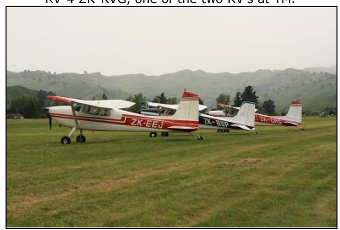
A trio of Cessna 185's out for the day.