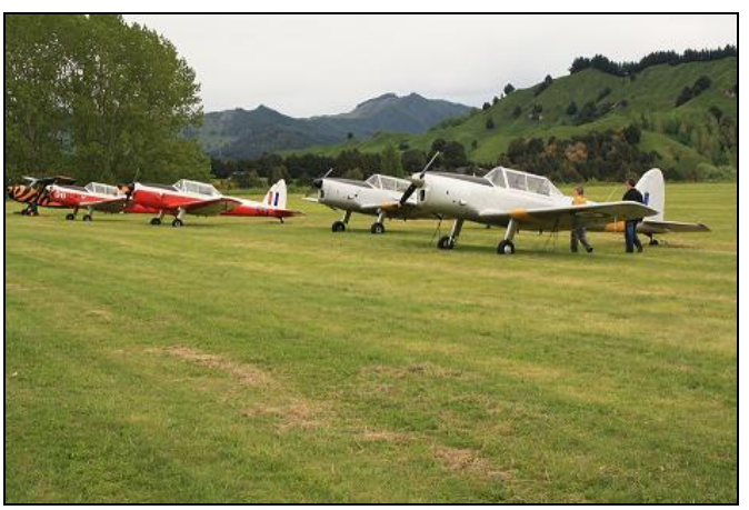
The four Chipmunks.

Some nine Tiger Moths had made it down for the Saturday, but there was also a good representation of other vintage De Havilland and non DH aircraft in attendance. This included four Chipmunks, two Piper Cubs, the Warbirds Beaver, and one of the Warbirds Harvards.