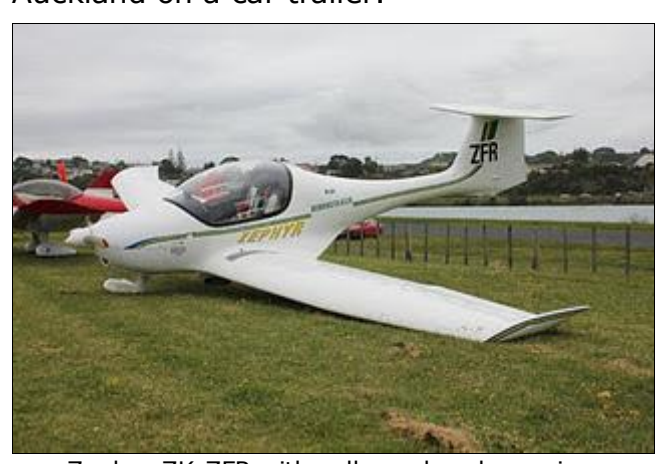
Zephyr ZK-ZFR with collapsed undercarriage.

Saturday saw two unfortunate incidents where aircraft were damaged but, fortunately, no significant injuries, personal pride excepted of course. In the first case a Zephyr microlight appeared to stall left wing down when entering the wind shadow of trees in the 40° right quartering cross wind. It suffered a collapse of the port and nose gear legs and a prop strike. After a fruitless search for a truck it was evacuated back to Auckland on a car trailer.