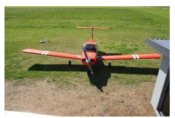
View of ZK-EVL as seen from Bruce's office atop the new house.

The house has a seven meter hangar which will house the Waiex aircraft Bruce currently has under construction and also an office atop the main house from which Bruce can survey the surrounding airfield and stunning views.