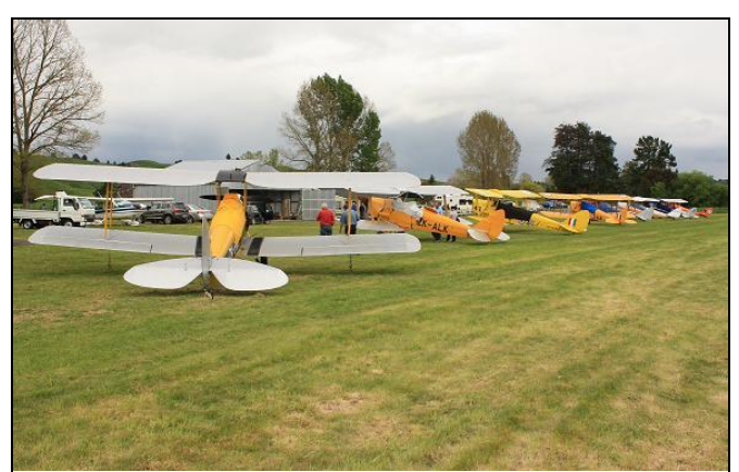
Eight of nine Tigers in attendance