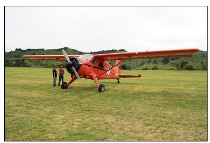
The Warbirds Beaver shows off her DHC colours.