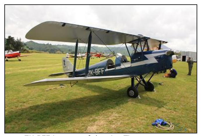
ZK-BFF just one of the nine Tigers present.