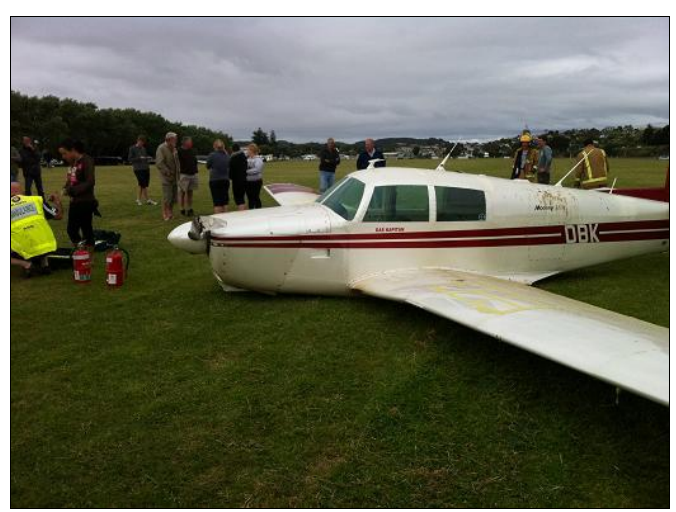
Mooney ZK-DBK after the mishap.

The second incident also involved an undercarriage when, shortly after 5.00 p.m. on the Saturday a Mooney suffered an under carriage retraction during take off. The reason is unknown, but somehow the lever for the all-mechanical system came out of its detent position as the aircraft bounced somewhat, causing the gear to snap up as the weight came back on to it. The aircraft slithered to a stop on its belly with a badly bent prop but fortunately no fire.