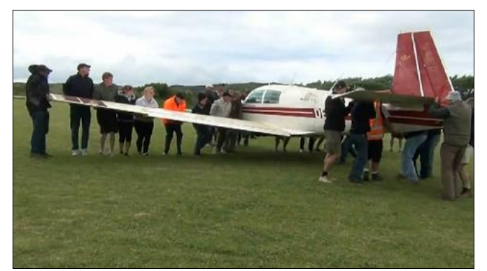
People power to the rescue

Rd microlight strip, to return before CET.