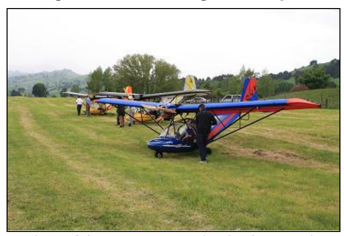
Three of the GMC Bantams shortly after arrival.

Also in attendance were a number of aircraft from various other aviation fraternities including the Gordonton Microlight Club with four Bantam microlights. Four Cessna 185's were parked on the flight line as well as two RV's and a smattering of other Sport, GA and Class II Microlight aircraft including Sonex JQP.