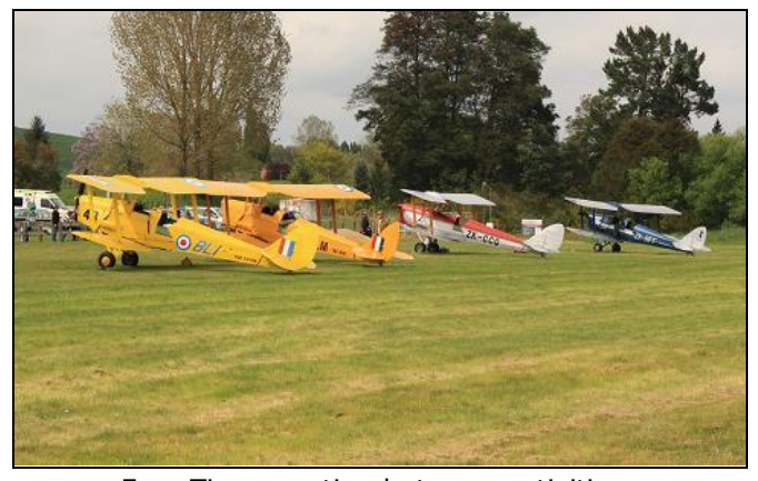
Four Tigers resting between activities.

Although the weather on the day was far from perfect we managed to make our way down to Taumarunui from Te Kowhai during the morning and arrived at Taumarunui about 11am. We arrived to find the Tiger Club members indulging in what they do best with aircraft busy participating in a bombing competition, doing aerobatics and giving a few fortunate recipients rides in these wonderful old machines.