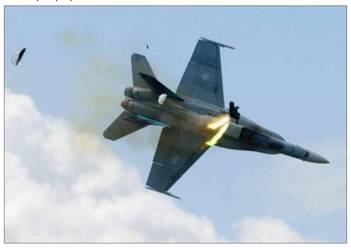
Gotta' depend on your equipment. Another life saved.

Then comes the amazing change in direction for the ejection seat and pilot! Note how the directional control on the ejection seat rockets has automatically changed the pilot's trajectory and attitude so that he is climbing away from the fireball that is about to happen. His drogue chute is also visibly deployed.