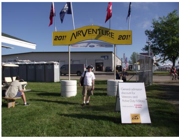
After dreaming about it for 20 years I'm here!

Camp Scholler at Oshkosh is absolutely massive. When we arrived at about midday on Saturday, the Camp was already about 75 percent full. This meant that the nearest camping was probably about 1.5 km from the AirVenture gate. Fortunately a friendly Warbirder with a golf cart helped Roy and I find a good camp site near an amenity block. The camp is very well run, amenity blocks are kept clean and while at times in high demand it is always possible to get a warm shower with minimal waiting. Coffee, food and beer are available at the camp store.