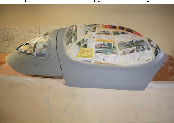
Kevins two part canopy

Kevin has also completed a significant portion of the work required to fit the canopy to the fuselage.