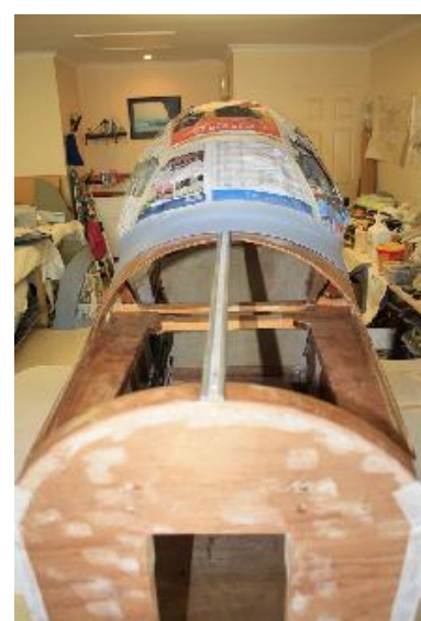
The forward 'Pulsar' style canopy rail

The canopy is in two parts and will use an opening system very similar to the Pulsar where the canopy slides forward on a rail on the forward fuselage. Kevin said he adopted this method after his original idea of having the canopy swing open to the right had caused the perspex to start cracking near the hinge. Kev figured if it was starting to crack just sitting in his garage then it was likely to get considerably worse once in use. As such he reworked the mounting system to follow the Pulsar approach.