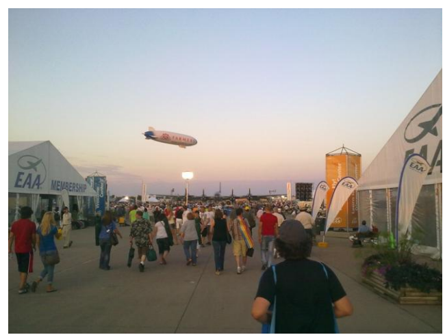
A beautiful evening for the very popular night airshow and fireworks display

The airshows were dominated by professional airshow performers, while spectacular and truly impressive, these tended to be largely the same from day to day. The night airshow however was different, think low level aerobatics in the dark while letting off fireworks from wingtips!